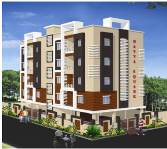
NAVYA SQUARE (Nagole)