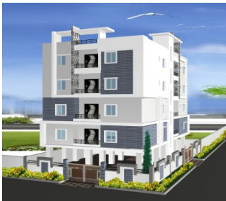
NAVYA CRYSTAL (Kondapur)