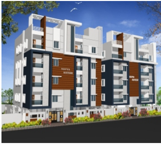
NAVYA KUTEER 1&2 (Kondapur)