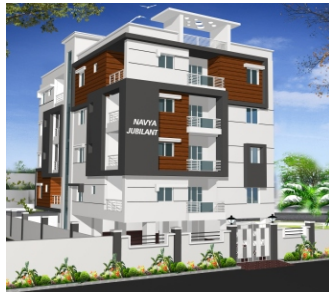
NAVYA JUBILANT (Film Nagar)