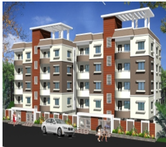
NAVYA NIVAS (Kondapur)