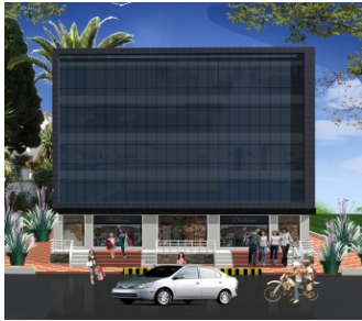
NAVYA VAZEER ESTATE COMMERICAL MALL (L.B. Nagar)